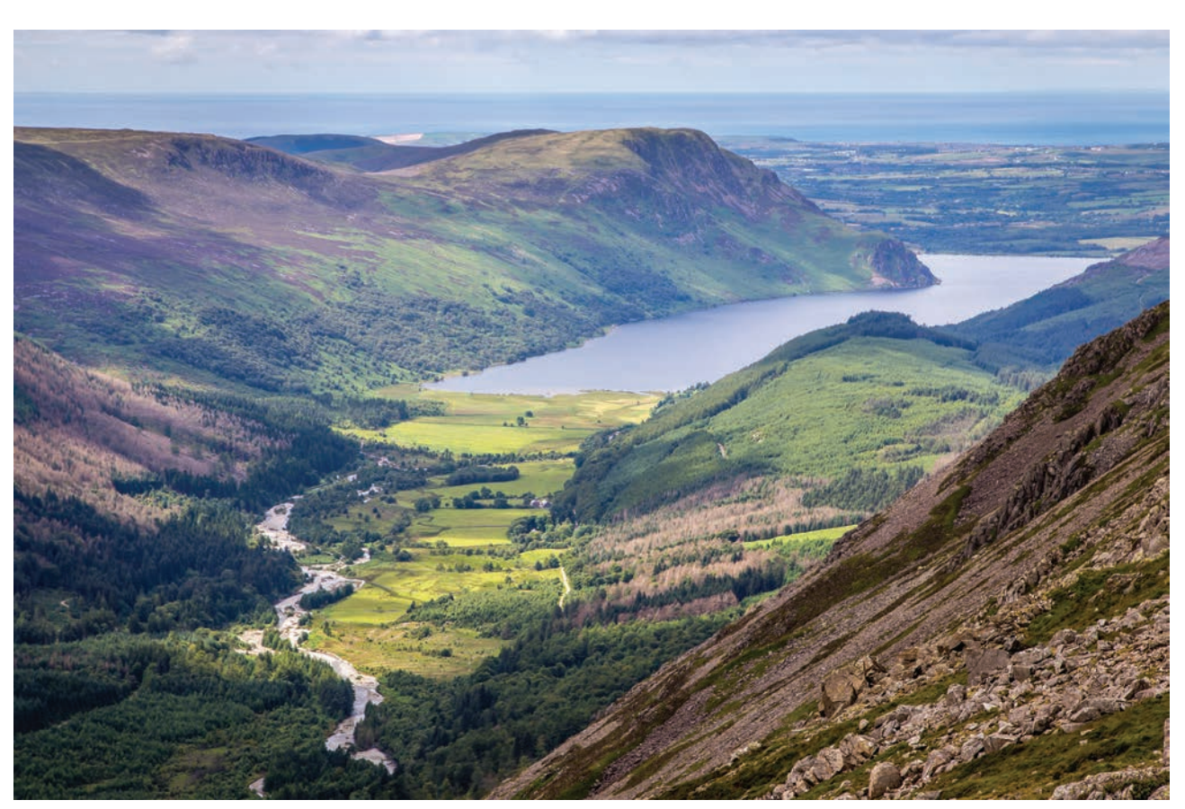
Fig. 1 – Ennerdale in the Lake District National Park